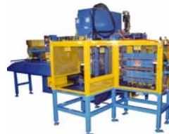
Cut to Length